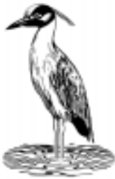
Yellow-crowned Night Heron