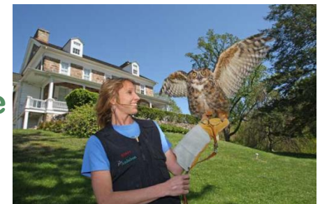
At the Center

Making the natural world come alive through hands-on activities