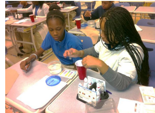
In the classroom

Making the natural world come alive through hands-on activities