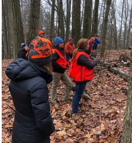
Foresters participating in our endorsement program.

This year Audubon launched a Forester Endorsement Program, the first of its kind in Pennsylvania. The program trains and endorses foresters who then use their expertise to implement healthy forest habitat projects across the state. The program teaches techniques that encourage healthy bird and wildlife habitat, and also creates young forests that can sequester carbon at faster rates. These managed forests provide critical ecosystem services to neighboring communities while making these habitats more resilient to a changing climate.