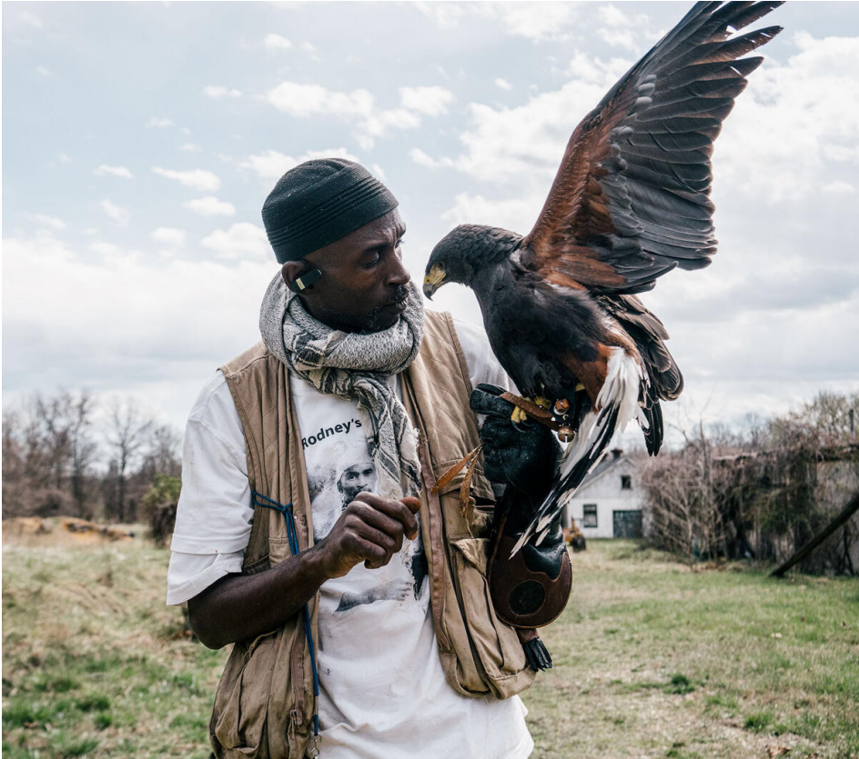
Rodney Stotts, one of the country's leading African American master falconers, Bird Brother author, and the subject of The Falconer documentary, captivated The Discovery Center audience as he shared his worldview that nature heals while addressing issues of social and environmental injustice.