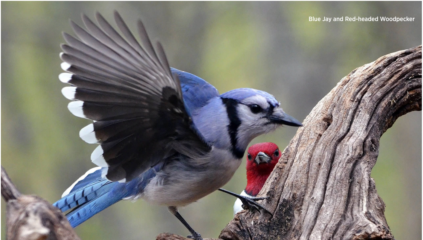
Blue Jay and Red-headed Woodpecker