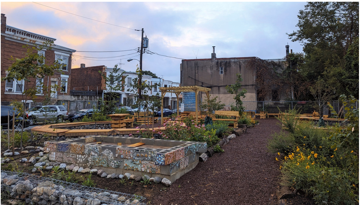
The Cecil Street Garden at sunset.

At the Discovery Center and John James Audubon Center, we created new and expanded existing native plant demonstration projects that highlight the importance of rain gardens, riparian buffers, and productive meadows. This fall, 60 volunteers helped plant 300 trees along the Perkiomen Creek riparian buffer at the John James Audubon Center to replace trees that were destroyed during Hurricane Ida in 2021.