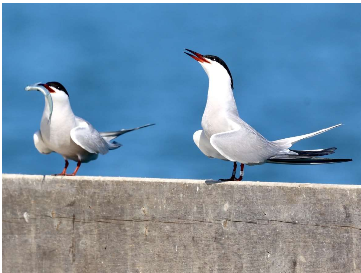
Common Tern Nesting Platform

Black skimmer in water.