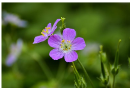
Wild Geranium ( Geranium maculatum )