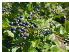
Arrowwood Viburnum ( Viburnum dentatum )