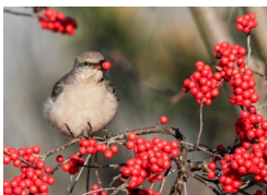
Common Winterberry ( Ilex verticillata )