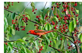
Cherry (Black, Pin, Chokecherry) ( Prunus spp.)