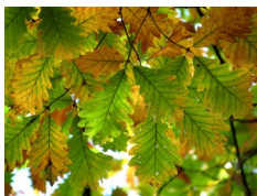
Oak (White, Black, Red, Pin, Scarlet, Chestnut, Swamp White) ( Quercus spp.)