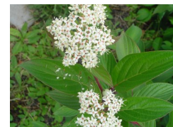
Red Osier Dogwood ( Cornus sericea )