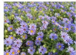
Aromatic Aster ( Symphyotrichum oblongifolium )