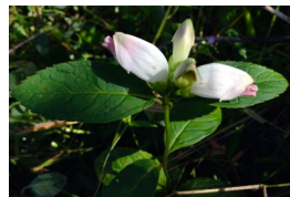
White Turtlehead ( Chelone glabra )