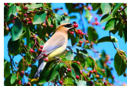
Serviceberry (Common, Allegheny, Canadian) ( Amelanchier spp.)