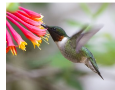
Trumpet Honeysuckle ( Lonicera sempervirens )